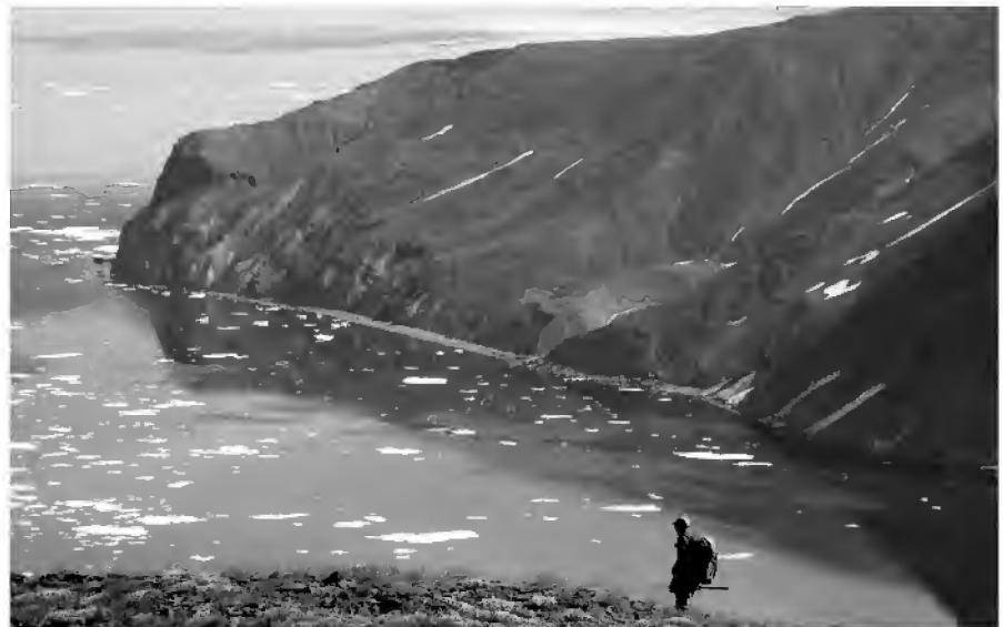
Taking in the view in Akpait National Wildlife Area, Baffin Island.